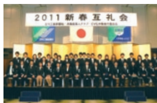
Awards ceremony at the 12th Campus Venture Grand Prix Osaka

We intend to continue to support the contest in future years.